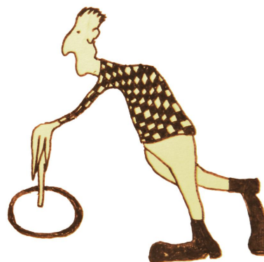
Illustration by Hubert Wencel